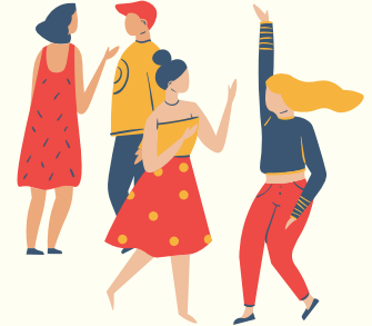
Ellos / They