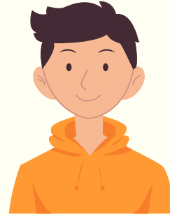
Él / He