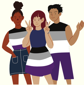
Nosotros / We