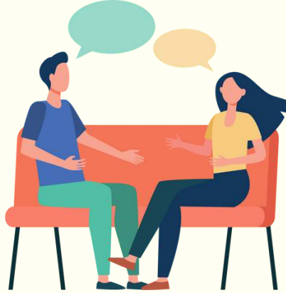
Tú / You