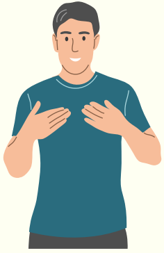
Yo / I