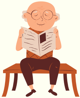
Usted / You