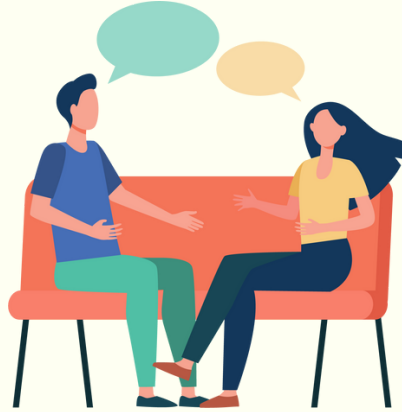
Tú - You