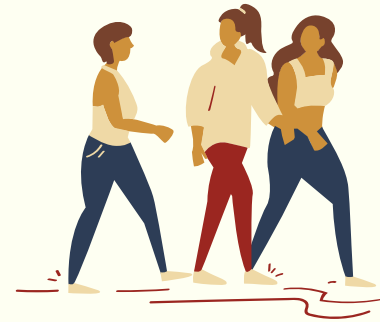
Vosotros / Ustedes - You (Plural)